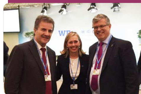
COP21 in Paris, France