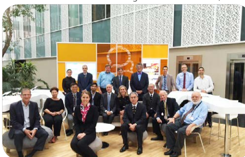
Leadership Circle at Groupe UP in Paris, France

"We must ensure that people are at the centre of economic decisions in an approach aimed at social development," indicated Monique F. Leroux at the conference "Is human capital the future of countries?" , Economic meetings d'Aix-en-Provence.