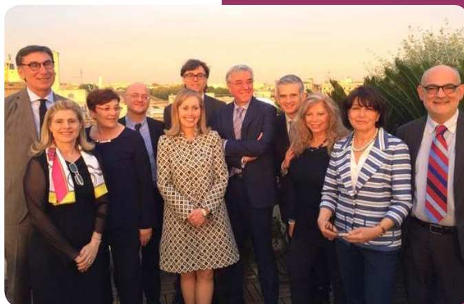
Representatives of the Italian co-operative Movement