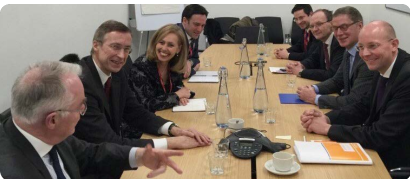
Meeting between the European Association of Co-operative Banks (EACB) and the Chairman of the Financial Stability Board