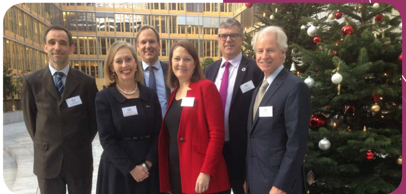
B20 in Berlin, Germany