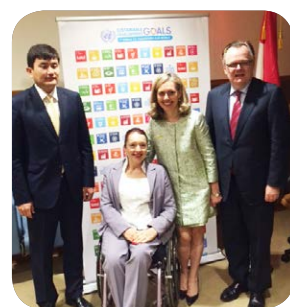
With UN Ambassadors of Canadian & Mongolia and DESA Director at the the United Nations