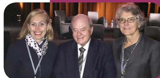
CIRIEC International Congress in Reims, France