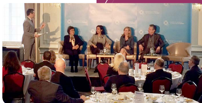
Co-operative panel, luncheon-conference organized by the CQCM in collaboration with the Chambre de commerce de Québec