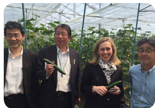
Fukushima agriculture association