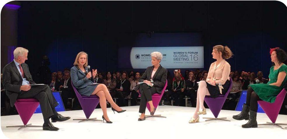
Women's Forum in Deauville, France

After the Summit, in response to an invitation from the Women's Forum, I participated in the panel on the collaborative economy. The co-operative and mutual Movement have to rise to the occasion in terms of grasping the opportunities offered by this new economy, and understanding the challenges it brings. We must position ourselves because this economy shares principles with the co-operative Movement, such as responding to local demand and buying local. We can influence the outcome to ensure that it benefits communities.