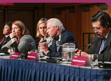
Annual General Meeting of the Alliance in Quebec City, Canada