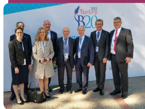
B20 2015 in Antalya, Turkey