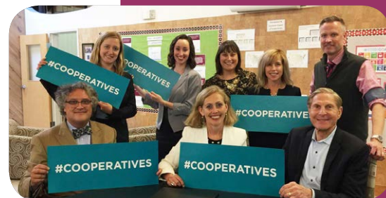
CCA Global Partners in Manchester, United States

Two key events took place right before the International Summit of Co-operatives. The first one was the 31 st CIRIEC International Congress, which brought together a number of researchers and think tanks in our Movement, and the second was in Budapest, where I addressed a meeting of European investors. On both occasions, with their different audiences, I had the opportunity to highlight what makes co-operatives so special, particularly in the current political and economic context.