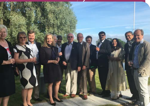
SOK, in Helsinki, Finland