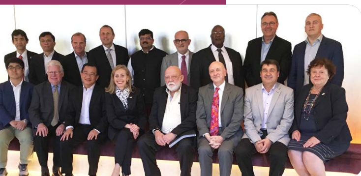
Members of the board of directors in Sydney, Australia

Our first board of directors meeting following the general assembly and global conference in Turkey took place in Sydney, Australia. We came together for the first strategic session. That was where the Alliance launched the brainstorming process, with the initial emphasis on our strengths and weaknesses, and the opportunities available to us. That was also when we launched the work for the grant by the European Commission, which soon led to the official signing in Brussels.