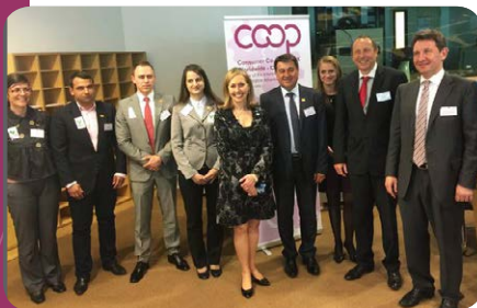
Consumer Co-operative Worldwide in Brussels