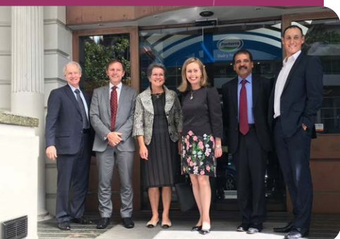
Visit to the Fonterra co-operative, New Zealand

indicated Monique F. Leroux during an interview with interest.co.nz