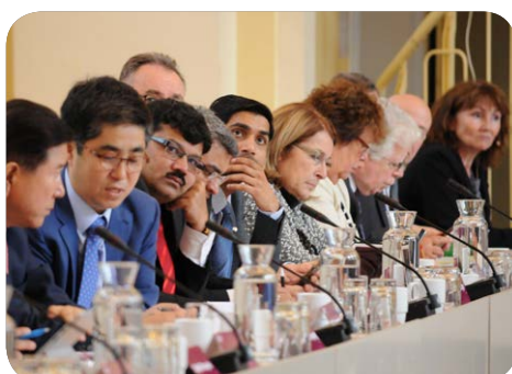
Board of directors in Stockholm, Sweden