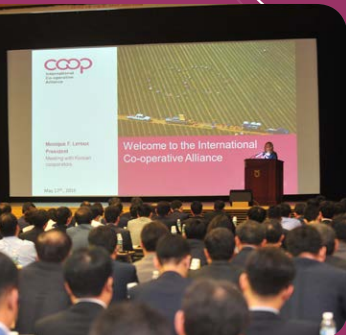
Presentation to the NACF