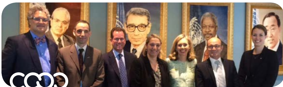
Day of meetings at the United Nations in New York, United States

On June 29, we went to the United Nations, where we were able to meet with DESA, ILO and FAO representatives and discuss the contribution of the co-operative and mutual Movement to the sustainable development of communities. We were treated to a private breakfast with Canada's Ambassador, Marc-André Blanchard, and close to a dozen ambassadors and the UN Deputy Secretary General, Jan Eliasson, to discuss how society is evolving. It was a key moment in terms of the impact, visibility and recognition of the co-operative Movement.