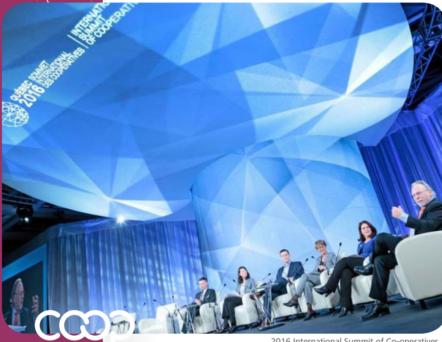
2016 International Summit of Co-operatives

Thank you to all of the participants, panelists, speakers and organizers for their contributions to this tremendous collective event.