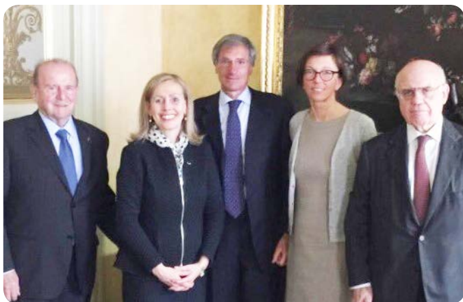
Meeting with CIBP in Rome, Italy