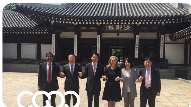
Representatives of the Korean Movement