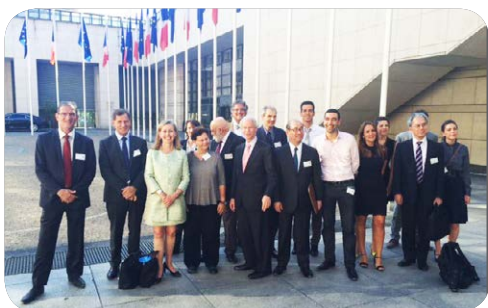
Ministry of Finance in Bercy, Paris, France