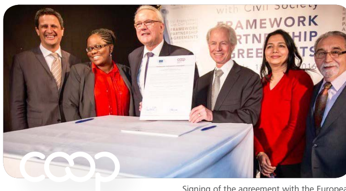
Signing of the agreement with the European Commission in Brussels