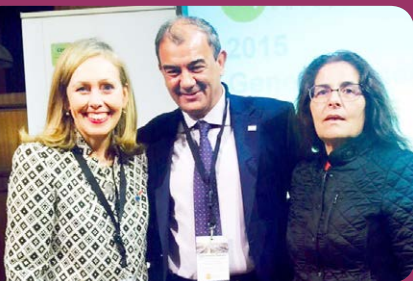
Co-operatives Europe General Assembly in Brussels