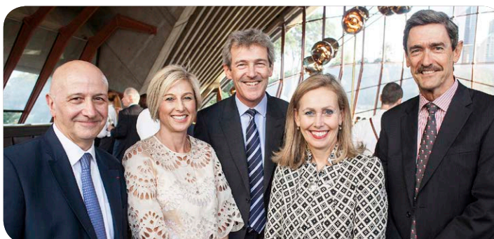
Investment & Trade dinner given by the Alliance in Sydney, Australia

We took advantage of our presence in Australia to continue on to New Zealand, where we met with the representatives of the co-operative Movement, in particular the people of Fonterra and the New Zealand local federation. Once again, we were welcomed by ardent supporters of cooperation.