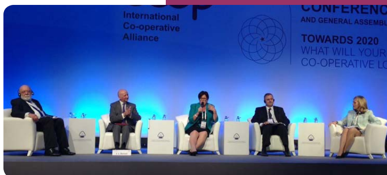
Alliance's general assembly and global conference in Antalya, Turkey